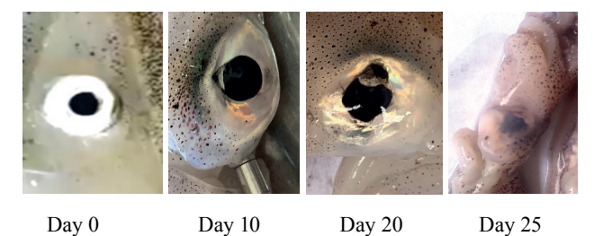
Figure 3 Changes in color and status of squid eyes during storage

The textures of the mucus on the body were transparent (day 0); Transparen, viscous, thin layer (day 5); less sticky, watery (day 10); less sticky, watery (day 15), and none (day 20).